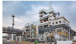
Dahej: Polyurethanes, Care Chemicals, Polymer Dispersions