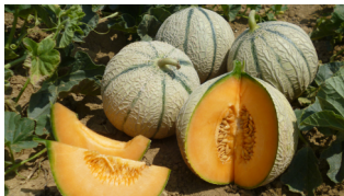
Medchal: Seed processing and Quality Testing facility