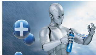
Chennai: Industrial Coatings, Surface Treatment Solutions