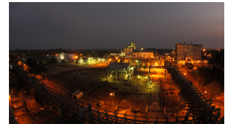
Mangalore: Dyes, Polymer Dispersions, Coatings