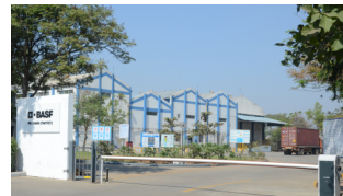
Panoli: Performance Polyamides