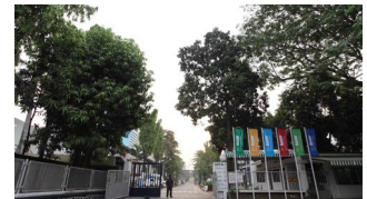
Thane: Engineering Plastics, Polyurethanes