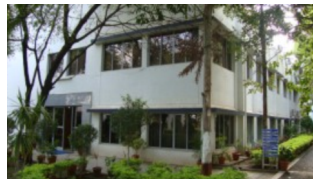
Pune: Industrial Coatings, Surface Treatment Solutions